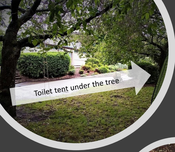
Toilet tent under the tree