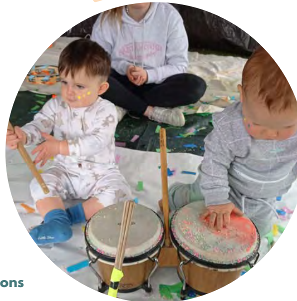
Quotes and photos from Starcatcher sessions

"This is why we come here for ideas, I can't wait to try stuff at home, it has shown me that all you need is a wee bit of imagination, not loads of stuff."