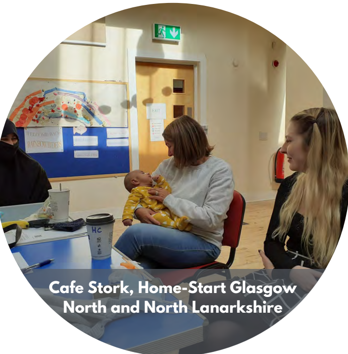
Cafe Stork, Home-Start Glasgow North and North Lanarkshire

"If not for Home-Start, I don't know how my life would be. You're a Godsend. My mood was so low before your support. Now I have people to talk to and you link me with whatever I need. Even when I still feel a little low, my mood always feels high again after each time my volunteer calls. From the bottom of my heart .... you're amazing!!"