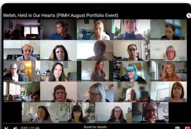
PIMH Fund Portfolio Event - August 22

"We would like to say that Inspiring Scotland have been one of the most supportive and flexible funders we have ever worked with. We are so grateful for your support and collaboration in making this project all that it can be."