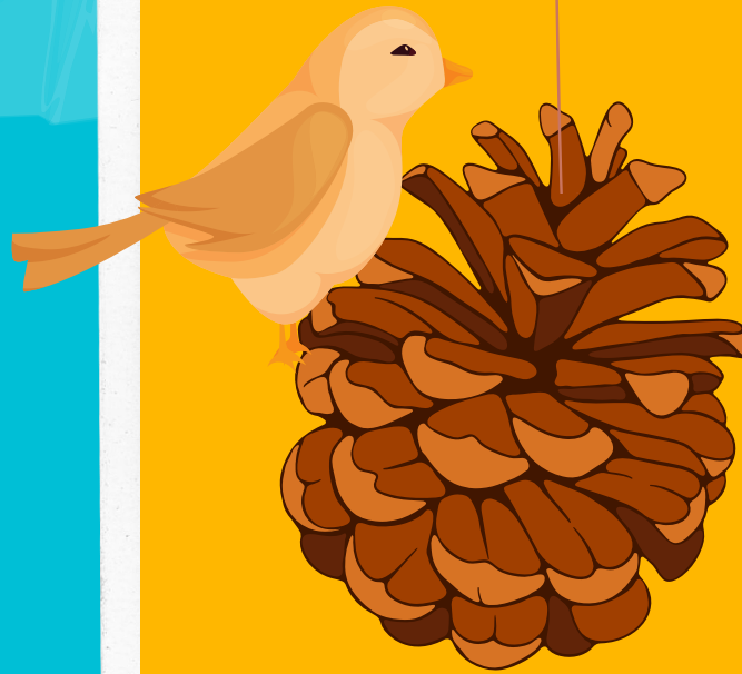
Pine Cone Bird Feeder